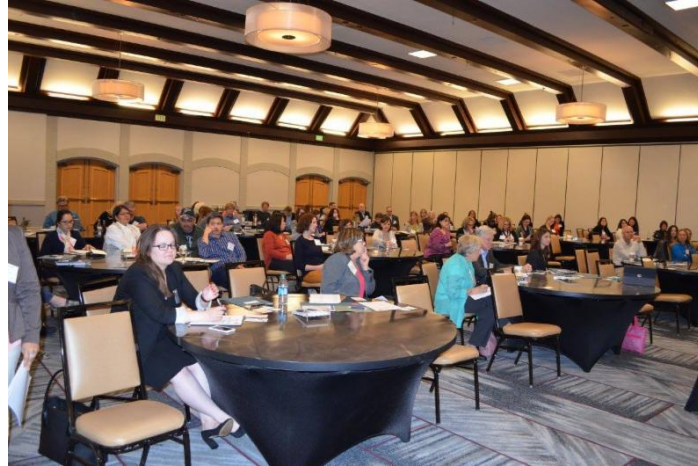
A full room of approximately a hundred attendees

Project. With a high need to ensure access to genetic services for underserved populations in the MSGRC region, which is home to a large Hispanic population, this project has relevance to the future work of Regional Genetics Networks (RGNs). Heartland and MSGRC continue to work together on strategies to effectively ensure access to services by the underserved populations in future years.