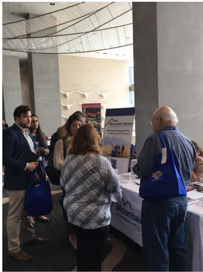
(Texas Team answering questions from TPS attendees)