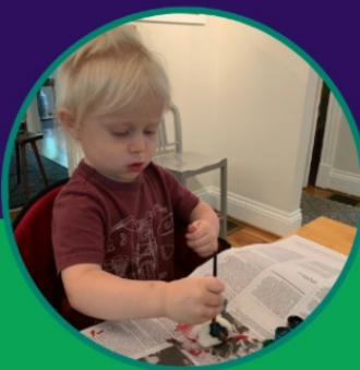
OUR YOUNGEST TEAM MEMBER