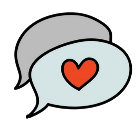
Questions to ask...