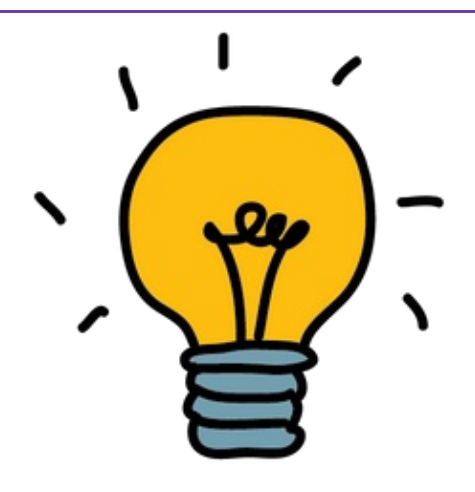
Understanding the Genetic